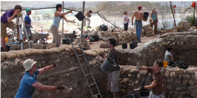
The Department's field school at Tel Dor, Israel, has led to some dramatic discoveries, including a gemstone dating back to 230 BCE that made worldwide headlines.

Classics faculty and students are engaged in a wide array of scholarly enterprises, including archaeological, topographical, historical, historiographical, philosophical, folkloric, literary, theoretical, and cultural studies.